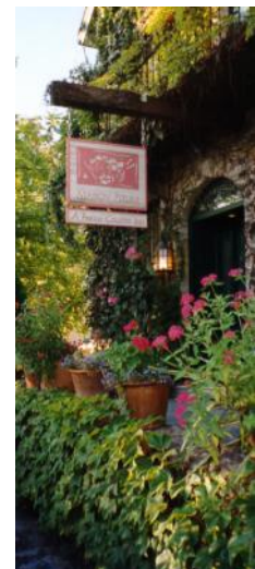
Maison Fleurie, Napa Valley

We sampled some great cabs. We picnicked every day and for our supplies found some great delis nestled in the heart of Napa. We encountered a wedding party at one winery picnic spot that loaned us a flowered