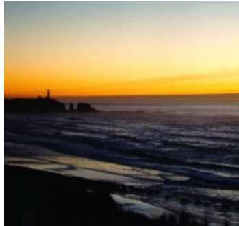
Sunset at Yaquina Head, OR

We spent a lot of time travelling in 1997, taking full advantage of Dick's newfound time. Since our Newport vacation home was completed, we visit there pretty frequently, averaging a week per month.