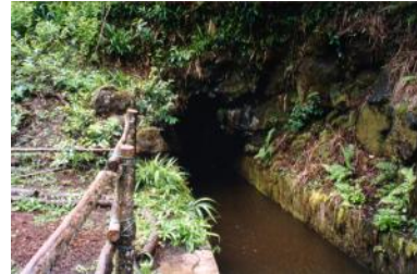
Canal & Tunnel, Hawi, Hawaii

Tree National Park and Indian Canyon), playing golf (don't ask—long break, no practice, rental clubs, etc.), and just looking around. The sun and warmth were a nice break from Oregon, which had it's second year of record rains. In May our "tropical phase" began with our yearly trip to Laguna Beach, followed in June with a week on Kauai and ten days on the Big Island of Hawaii.