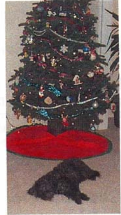
Waiting for Santa - 12/96