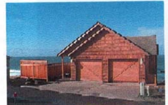
Our new home on the Oregon Coast - 11/96

After three years of planning and execution, our coast home was completed this September. It overlooks the ocean on a 100 foot bluff north of Yaquina Head Light in Newport, Oregon. While it was a lot of work, we are really pleased with how it turned out. So far we're spending about 30% of our time there, but only time will tell what the "steady state" split will be between Lake Oswego and Newport. However, after three months, we're still waiting for a phone line from US "Worst."