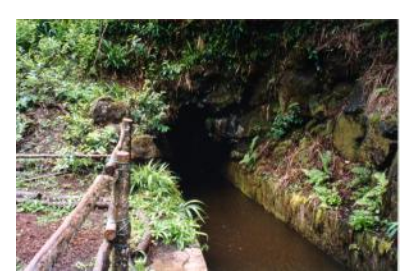
Canal & Tunnel, Hawi, Hawaii

warmth were a nice break from Oregon, which had it's second year of record rains. In May our "tropical phase" began with our yearly trip to Laguna Beach, followed in June with a week on Kauai and ten days on the Big Island of Hawaii.