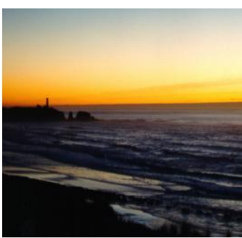
Sunset at Yaquina Head, OR

full advantage of Dick's newfound time. Since our Newport vacation home was completed, we visit there pretty frequently, averaging a week per month.